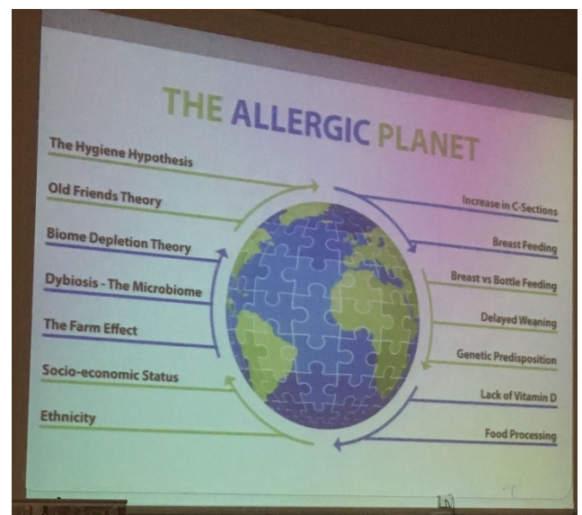
Figure 4 Synopsis of the Lecture