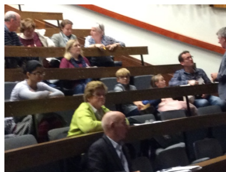
Figure 3 Snapshot of Lecture Attendees

list of 170 foods that can act as allergens). There is no cure for a food allergy so avoidance is the key to living with this type of disorder. A food allergy can develop at any stage in life so the presentation by Dr. Cahill was very appropriate for her audience (from age 5 to 75!). It can be triggered by a virus or bacterial infection or by stress and who not experience stress at some time body's immune system is designed viruses and sends out antibodies to prevent infection. However, the 'misfires' and attacks something reaction. This is the case in food system recognises an otherwise foreign invader and attacks it. Food cases, to a sometimes fatal which can kill within 20 to 30 intervention of adrenaline.